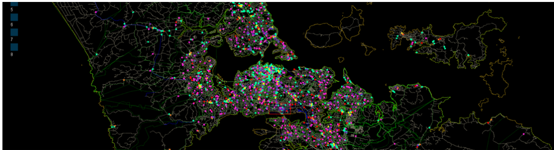
Fig. 1: Government silo's data and LINZ data rendered from downloaded CSV files.

Without wishing to overstate the obvious, the aim of a site analysis is to gather pertinent information on a place that will help inform the design of a building intended for that specific place. With the exception of procuring information through geographical information systems (GIS), the process of gathering data for a site analysis is much the same as it was twenty years ago; a large portion of relevant data (foliage, building typology, traffic/pedestrian flow, local amenities) is gathered through visits to site. Although much of this data is available online, the aim of the professional application was to allow a user to focus on a particular location and render pertinent data. There was no presumption this application would replace a physical site visit, rather, could accessing and visualising soil, contours, land use and amenities in this way be more efficient?