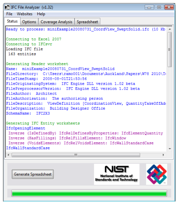
Figure 1: IFC File Analyzer

Another category of utility that is available optimizes an IFC data file to remove what is claimed to be redundant information. This can greatly reduce the file size and processing time required for working with an IFC data file. Examples of these utilities include the work of Pazlar and Turk (2007) and the Solibri IFC Optimizer (Solibri 2010b) as shown in Figure 2. For example, the Solibri tool claims resultant files at 5-10% of the original size through the removal of duplicated objects (as well as compression) and hence a faster loading time with fewer objects to process.