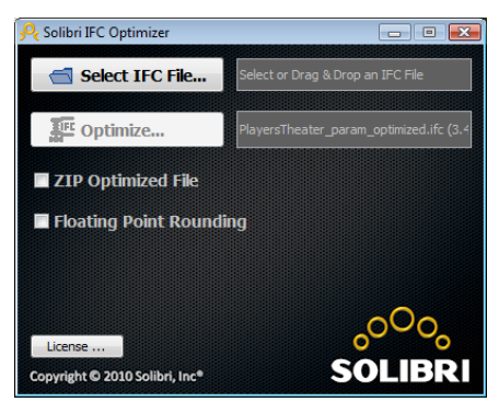
Figure 2: Solibri IFC Optimizer

Another category of utility that is available optimizes an IFC data file to remove what is claimed to be redundant information. This can greatly reduce the file size and processing time required for working with an IFC data file. Examples of these utilities include the work of Pazlar and Turk (2007) and the Solibri IFC Optimizer (Solibri 2010b) as shown in Figure 2. For example, the Solibri tool claims resultant files at 5-10% of the original size through the removal of duplicated objects (as well as compression) and hence a faster loading time with fewer objects to process.