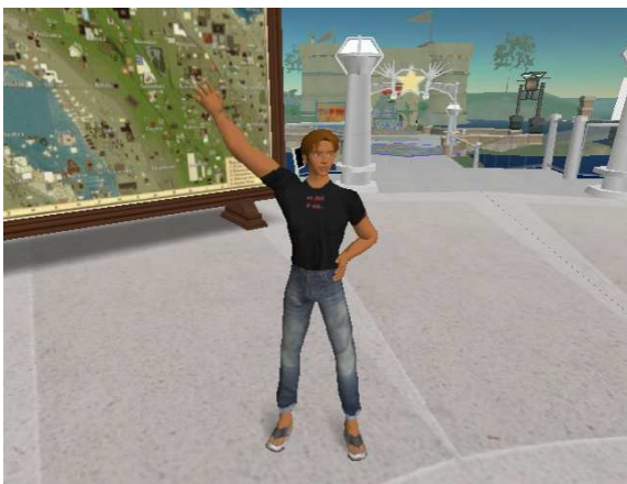
Figure 2: Avatar performing a 'Hey' gesture in Second Life

There is little existing literature to suggest how one should design a 3D gesture interface. We based our approach towards designing a logical and ergonomic interface on guidelines offered by Nielsen et al.[6]. Their suggested steps are: First, determine the desired functions of the gesture interface. Second, study the actions potential users would use to perform each gesture. Third, use that information to determine the gesture vocabulary or the system. Finally, benchmark the gesture interface using usability tests.