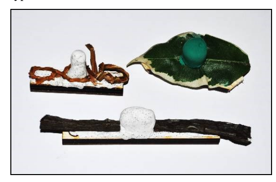
Figure 5 First prototype tangibles from top left: twisted grass, leaf and stick.

The first prototype had a default set of three pseudo symbols simply to provide a point of discussion (Figure 5). Other tangibles could be added by the process described above. Three members of the community explored this prototype.