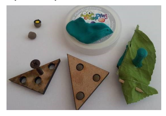
Figure 3 Tangible construction (from top left): a) pen tips with clay inside, b) conductive clay, c) MDF tangible baseplate with screw handle d) underside of the baseplate with pen tips in holes, e) a completed tangible.

dry modeling clay is then used as a conductive medium to join the tips, hold the Oroo' symbol in place and provide a grip for the user. Depending on the shape of the symbol, a handle made of a metal screw covered in clay may be added to the top of the baseplate.