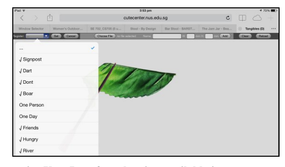
Figure 4 User Interface showing available images

Figure 4 shows the software menu. The top-left dropdown list contains a list of all available images. Those that have a tangible registered to them are marked with a tick. To add new images, the software allows users to choose a file, associate a name with it and set the size of the image. The "Clear" button clears the canvas and the "Reload" reloads the software from the server.