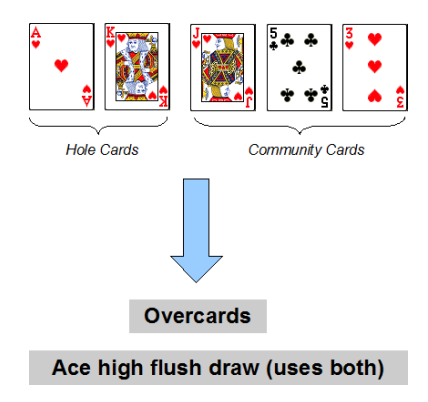
Fig. 2. Mapping a combination of five cards to a category that represents the current hand rank and the drawing strength of this hand.

During the flop and the turn all the community cards have yet to be dealt and therefore a player's hand has the ability to improve from one category to another, depending on which card is drawn next. It is therefore too simplistic to only consider the current hand category, so further classification is required for hands with the potential to improve. These types of hands are called drawing hands (in poker terminology). SARTRE considers two types of drawing hands: flush draws & straight draws . An example mapping is illustrated in Fig. 2.