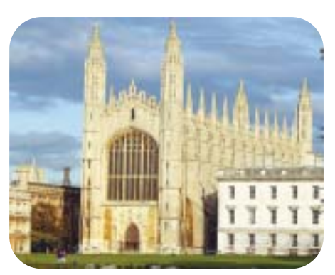
Cambridge: the cream of Europe

This analysis suggests that it would be wrong to conclude from the World University Rankings that the US has all the excellent institutions. Based on our criteria, Harvard