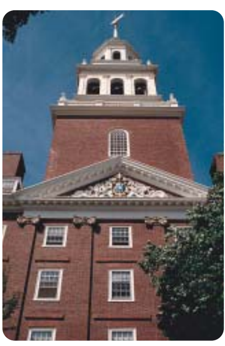
Pre-eminent: Harvard University is still tops

Over the next decade, the same may start to happen in China and a greater number of continental universities may adopt similar tactics. US universities may have produced the innovations needed to foster globalisation, but it does not follow that they will be the ones to benefit.