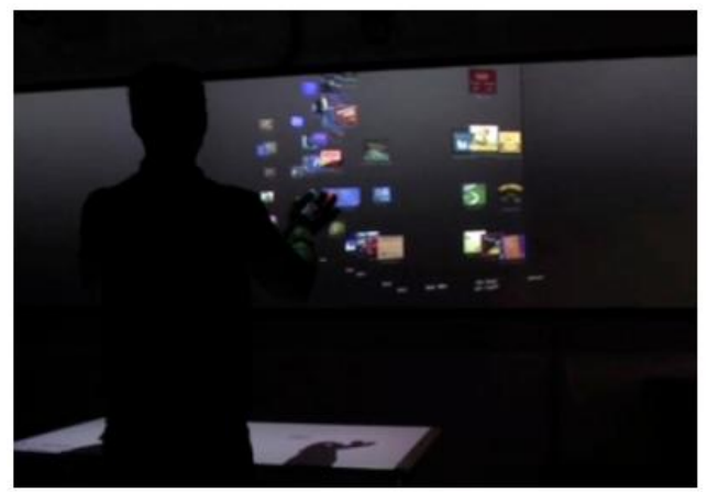
Figure 2. G-stalt [10]. The table in front of the user is can be interacted with in order to apply additional filters to the data.

Additionally Zigelbaum et al. [10] developed an interaction paradigm for cube-shaped data which utilizes the thumb, index and middle figure in order to rotate and translate data on the y, z, and x axis respectively. These gestures although logical, are obviously not self-revealing and their effectiveness and complexity was not sufficiently evaluated by the authors.