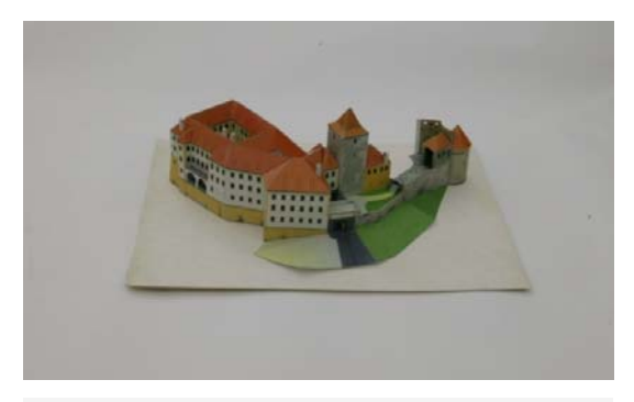
Figure 3 shows the original model of the Daliborka tower and its generated point clouds.