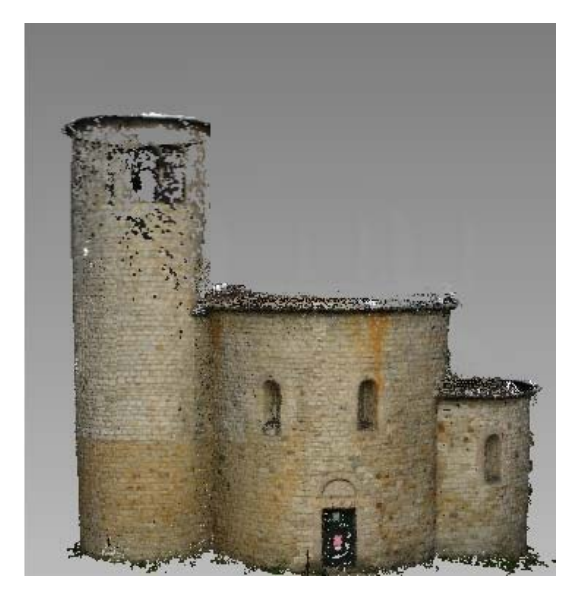
Figure 6.4b. Reconstructed model of Saint George Church. Number of images: 63 [2048x3072]. Running time: approximately 9 hours.