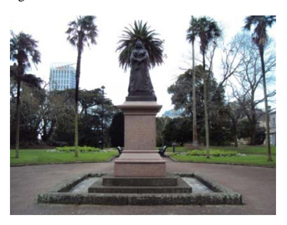
Figure 6.1. The statue of Queen Victoria, Mt Albert Park, Auckland - Original view.

This is caused by large variations in the point cloud density, which the surface reconstruction algorithm was unable to deal with.