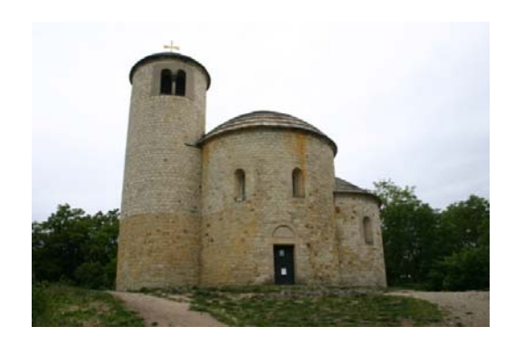
Figure 6.4a. Saint George (3D Reconstruction Dataset. Centre for Machine Perception). Input images: 63 [2048x3072].

The third data sets consisted of 63 images of Saint George church. All images were taken from ground level. Since the roof of that building is quite flat, this resulted in missing information about the roof structure and the reconstructed model contains large gaps in that area. We intend to overcome this type of problems with a sketch-based interface, which allows the users to add missing geometric details. The model contains of 28846 faces.