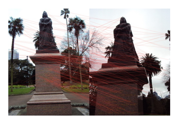
Figure 2. Matched Features.