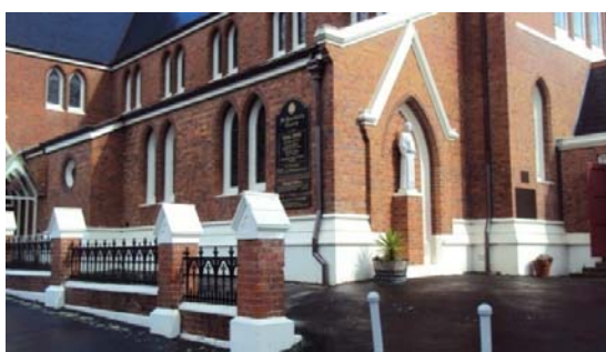
Figure 6.3a. Saint Benedict Church, Auckland.