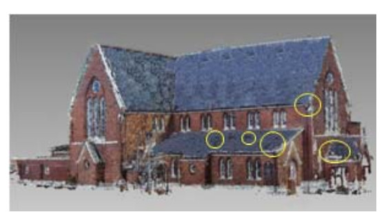
Figure 6.3b. Reconstructed model of Saint Benedict Church. The yellow circle indicates a reconstructed region which was invisible in all input images. Number of images: 55 [3648x2056]. Running time: approximately 6h40 hours.