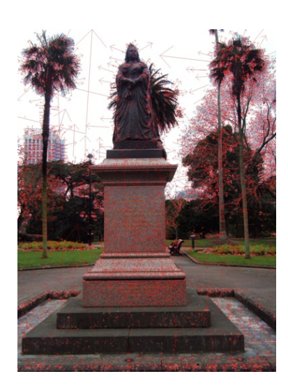
Figure 1. Feature Extraction - The red arrow symbol indicates the detected features. Detected features are displayed as vectors indicating scale, orientation and location.