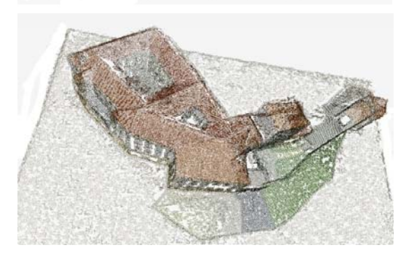
Figure 3. Model of the Daliborka tower (3D Reconstruction Dataset. Centre for Machine Perception) and its generated point clouds.