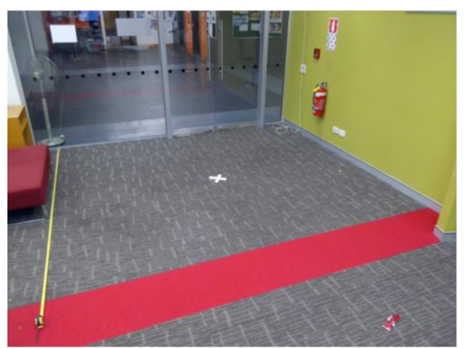
Figure 6: The environment for usability testing

The tests were carried out in two locations; the first environment was set up in a study area of the Engineering building at the University of Auckland, while the second environment was set up in a study area of the main student building. A mock room of approximately 4x4m was created by denoting a space with physical walls and tape measures (see Figure 6).