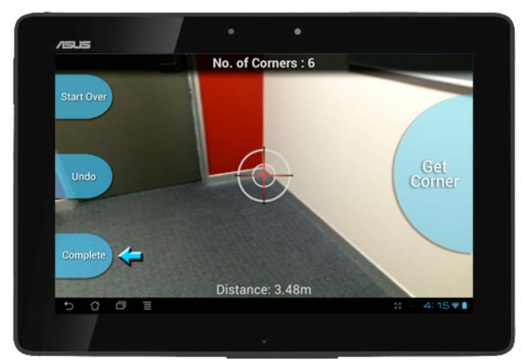
Figure 3: Screenshot of MeasureCornerActivity

Also, the "jolt" effect when the user measures the corner must be taken into account. When the user presses the button to get a corner measurement, the motion will cause the device to "jolt" for a fraction of a second, influencing the measurement taken and corrupting the result. In order to resolve this, the sample-averaging method was extended so that the device took in 10 tilt measurements instead of 5, and the average is taken out of only the earliest 5 measurements. This discards the 5 most recent measurements, taken in period of 0.5 seconds, which is considered to be corrupted by the jolt effect (see Figure 3 for a view of corner measurement). An evaluation of this approach with a number of users indicated an accuracy of approximately \pm 20 cm after training of users.