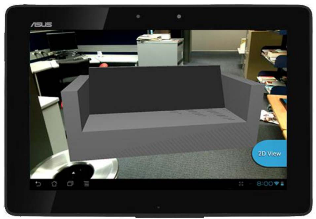
Figure 5: Screenshot of 3DViewActivity in operation

Once room coordinates have been calculated, however, the axes of the resulting coordinates of the subject space may not be aligned with axes of absolute coordinates, neither the corners completely perpendicular to each other. This is due to the fact that the absolute axes are aligned to the absolute North direction, while the axes of the virtual blueprint are aligned to whichever direction the room was in. Therefore, after derivation of corners, the virtual blueprint aligns the axes with absolute coordinates. First, the angular displacement of each wall in relation