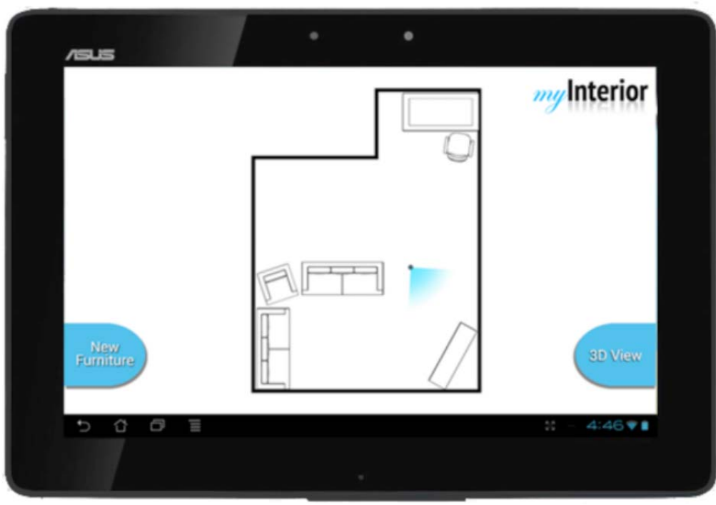
Figure 4: Screenshot of 2DViewActivity in operation