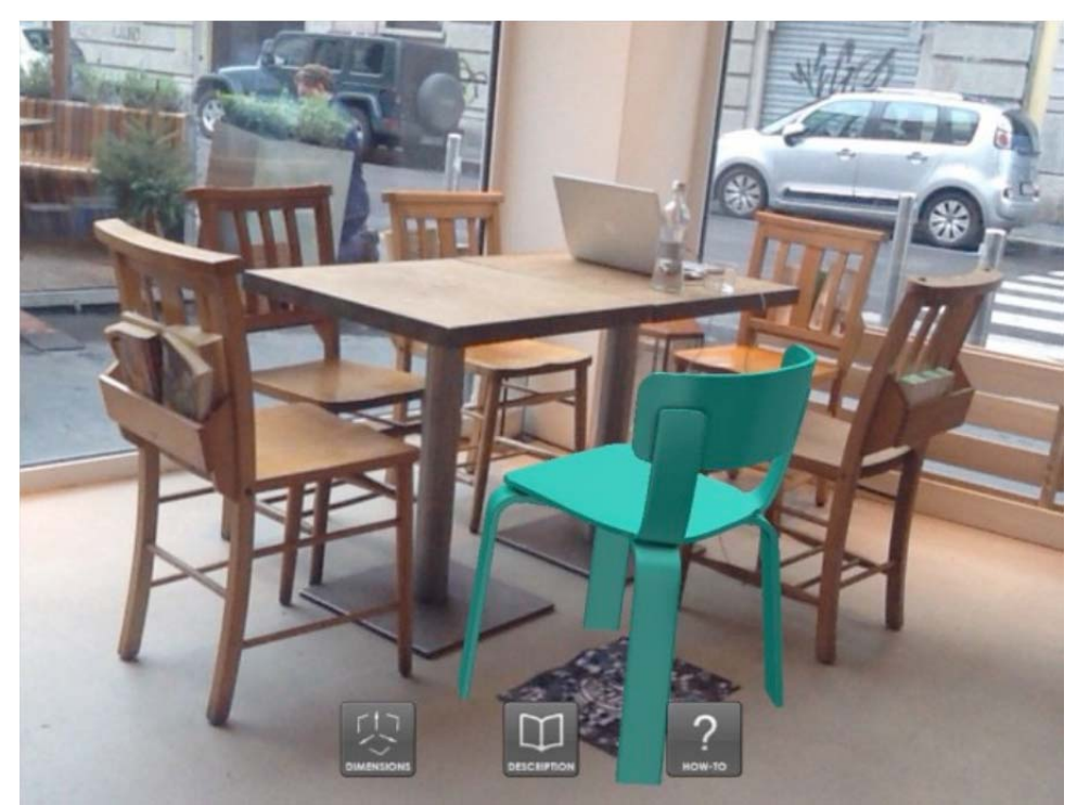
Figure 1: Sayduck's Augmented Reality interior design application in action (Thurab 2012)

Research by Feuerstack et al. (2011) is an attempt to improve upon the traditional marker-based AR. In this browser-based system, virtual objects can be freely placed and moved around even when the marker is fixed, giving the user more freedom. Yet this approach still suffers from the limitations of a marker-based approach to AR; if the marker is not within camera range, augmented reality will cease to function, limiting the user's ability to envisage the space.