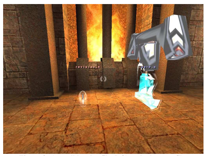
Figure 2: A small header file (left) and a large .c file.

Files can be picked up by shooting at them. When this occurs, the file disappears from the map, in all players' views, but a "T" icon appears on the side of the screen of the player who is now holding the file. The player can then walk anywhere on the map, and press the item use key to drop the file at the new location. The file than appears at this new place in the map. In the current implementation, there is no way for players to distinguish if a certain player is carrying a file. This may cause some confusion due to "missing" files, so this feature should be added in a later version.